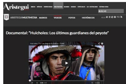
Aristegui Noticias (Mexico)