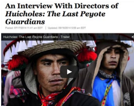
Huffington Post (USA)