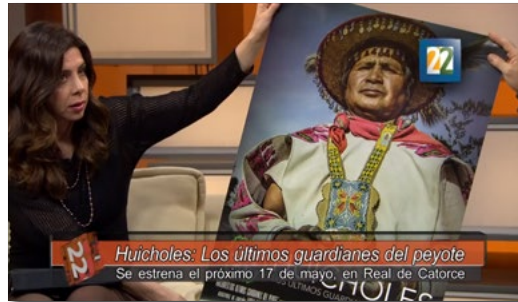
Canal 22 (Mexico)

Since then, several Mexican and international media have covered the main screenings and presentations in festivals, as well as collaborating with the promotion of the case of Wirikuta, with more than 50 press articles in both traditional and alternative, printed and digital media, radio and TV. Links to the main articles on our page at IMDB: imdb.com/title/tt3294878/externalreviews?ref=tt_ov_rt