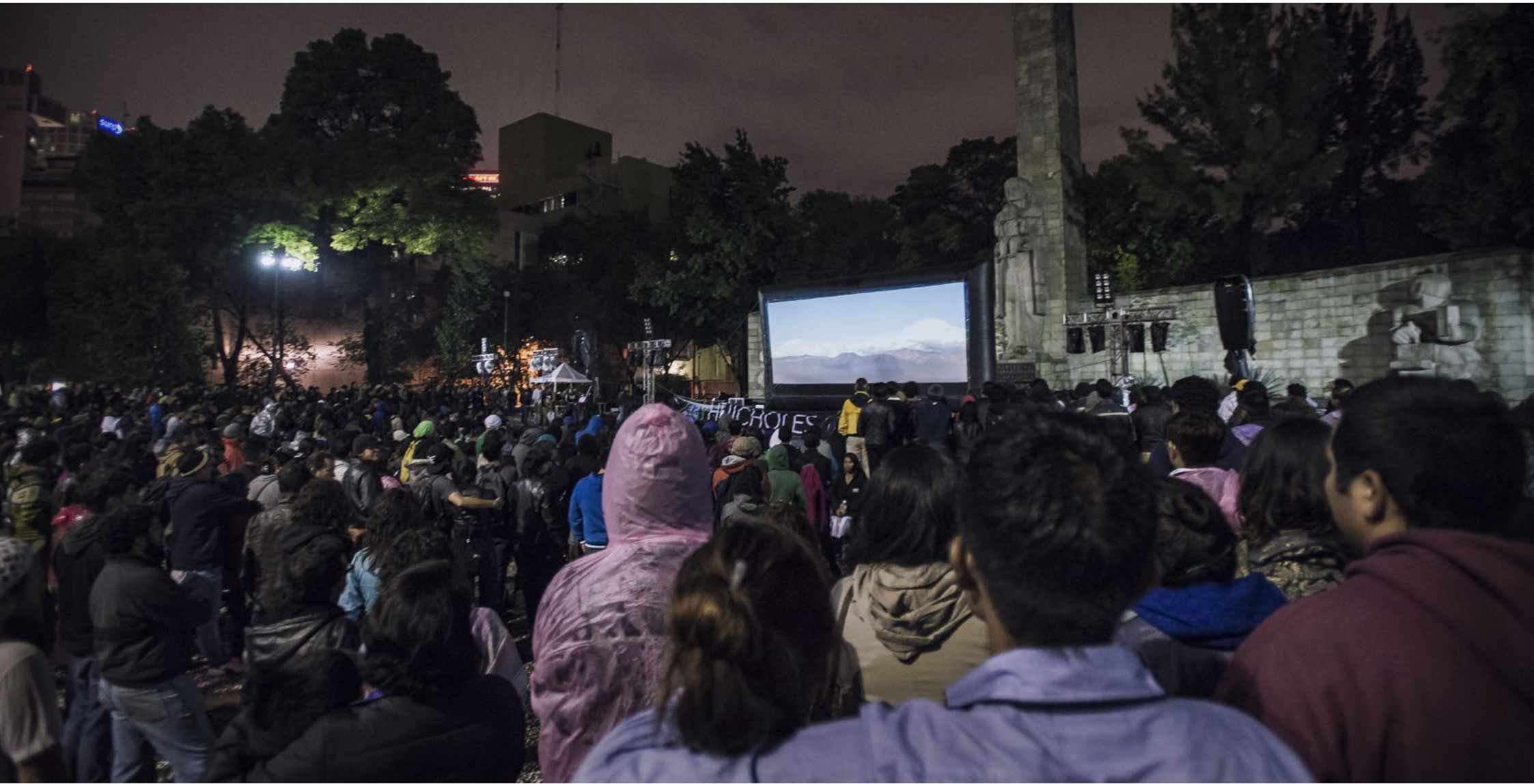
More than 2,500 people gathered at the “Monumento a la Madre” under a heavy rain, to watch the premiere in Mexico City.