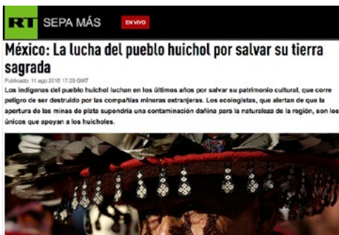
RT in Spanish