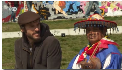
Deutsche Welle (Germany)