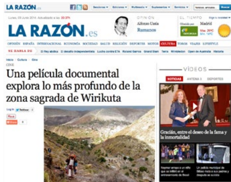
La Razón (Spain)